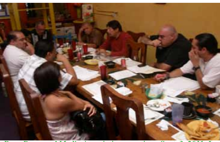
been relentlessly fighting and Raza Press and Media Association meeting -Sept. 3, 2011, Los Angeles.

What we are witnessing is a concerted Shaming Young People Who Take Edu- effort to criminalize all "immigrants". The undocumented are demonized as resource usurping invaders; corporations lance, 7. Television, 8. Fundamentalist use the criminalization of immigrants Religion and Fundamentalist Consumer- to deflect attention from their oppress-