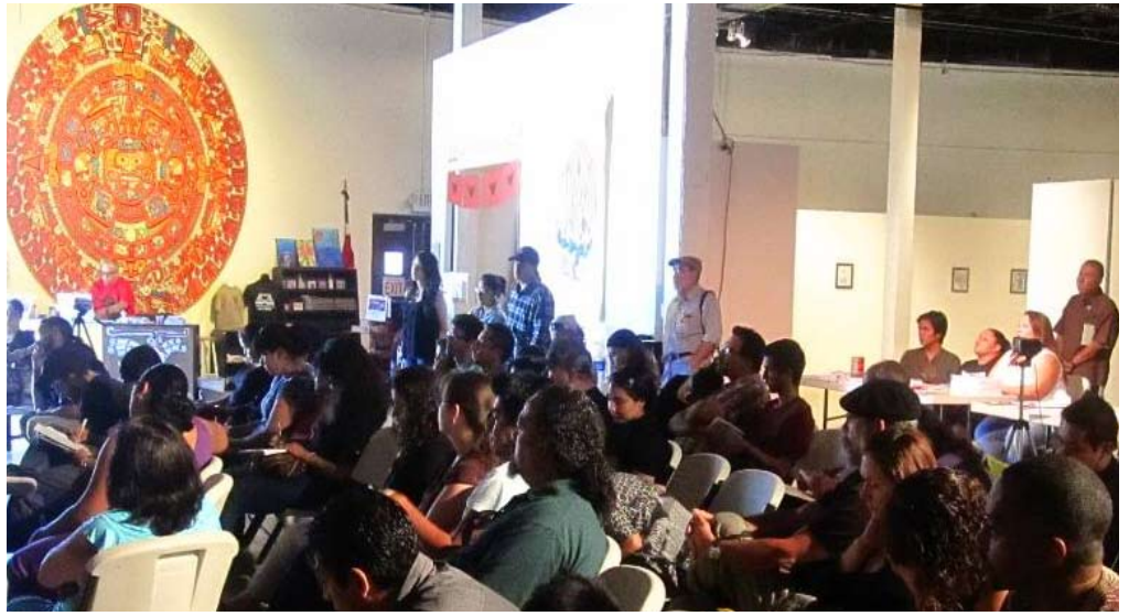
Conference on Raza Prisoners and Colonialism June 20, 2010, Centro Cultural de La Raza, San Diego, Califazt-