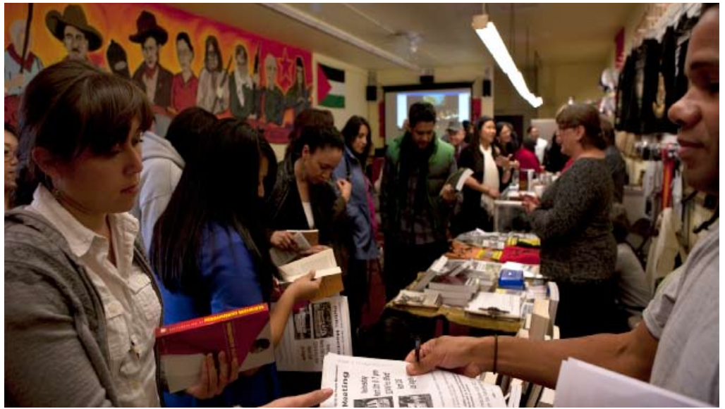
Raza-Barrio Book Sale/Exhibition