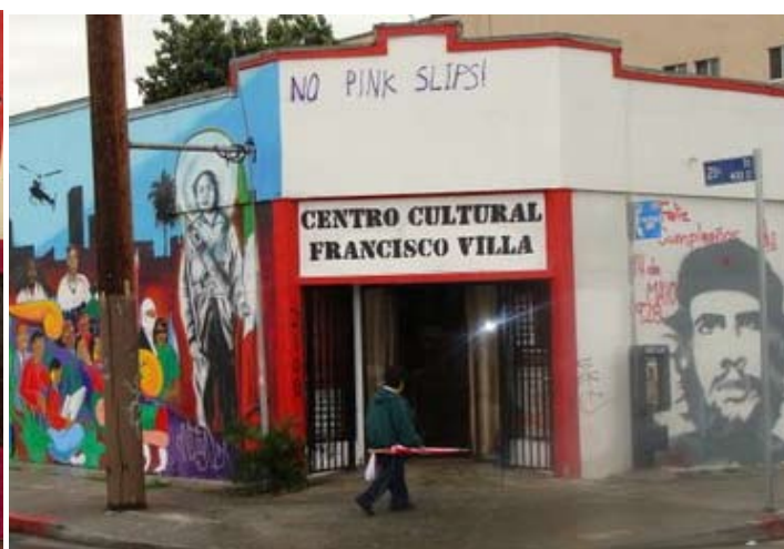
Centro F. Villa.